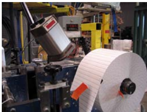
DT-315A Viewing Labeling Machine